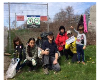
Clean-up of under-pass at Lakeshore

"2016 finished ahead of budget, driven by reduced expenses."