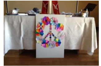
Children remember peace