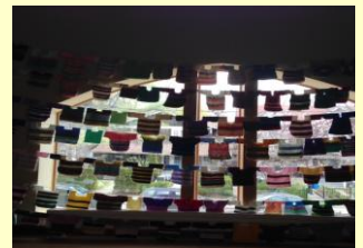
Blessing of vests & bikes