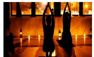
Winter Solstice Candlelit Yoga