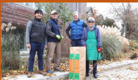
Fall garden clean-up